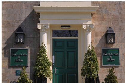
Harrogate The underground entrance to the Hotel du Vin & Bistro on West Park.