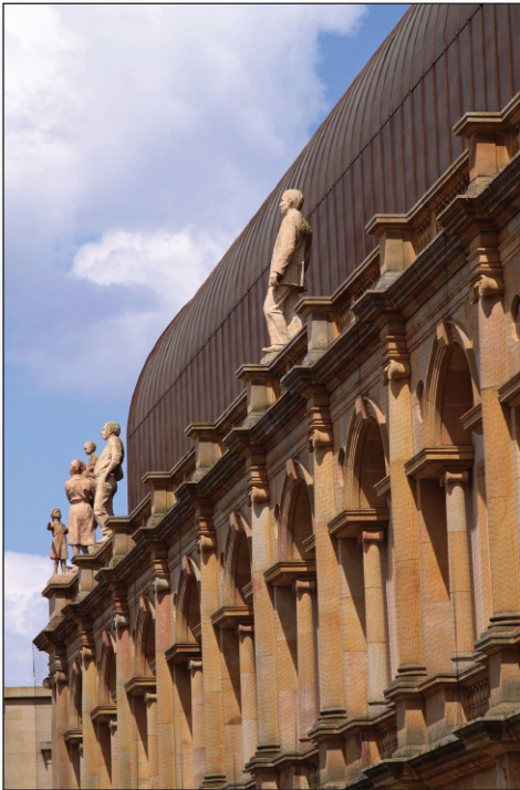
These statues perched on top of the Victoria Shopping Centre enjoy an unparalleled view over Harrogate.