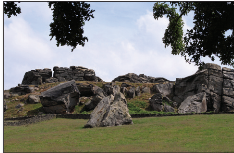
Almscliff Crag. To the south-west of Harrogate this crag stands just outside the village of North Ripton and forms the destination for a popular short walk.