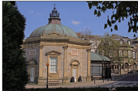
The Royal Pump Room, Harrogate's original sulphur well.