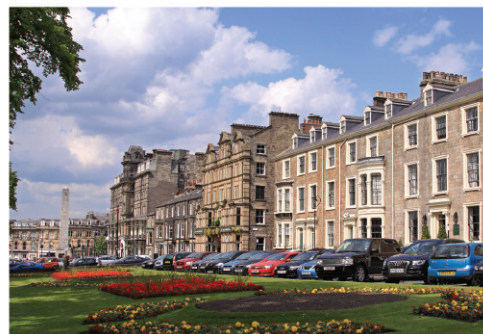
West Park Regency town houses flanked by colourful gardens line West Park, which leads towards The Sney from the war memorial.