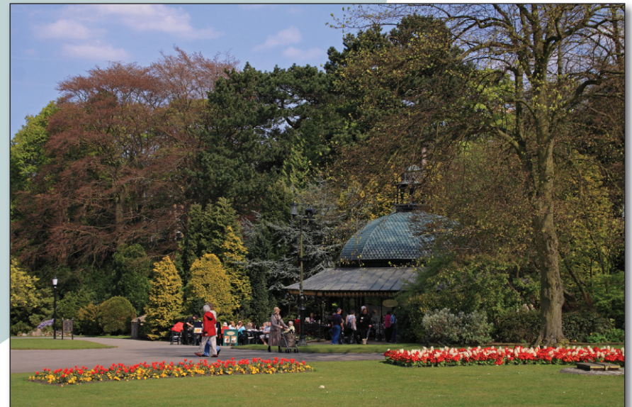
Valley Gardens café. A popular venue winter or summer, the café in Valley Gardens is shaded by a wide variety of trees. Behind it lies a pool for model boat enthusiasts.