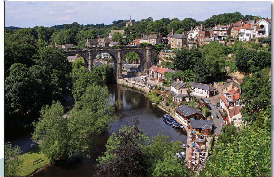
This is perhaps Knaresborough's best known vista, taking in the River Nidd and the railway viaduct, from the grounds of the castle.